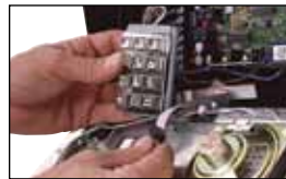
modular design makes installation and service easy