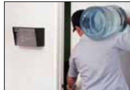
flash entry codes allow entry on a single day only, then automatically deactivate themselves