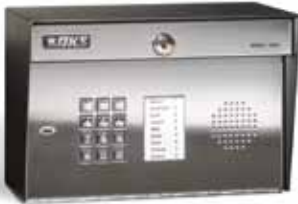
surface mount with built in directory/ message window