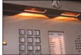
led lighting illuminates keypad and directory