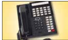
dtmf tone output allows these systems to be used with PBX, KSU and telephone systems with auto-attendants