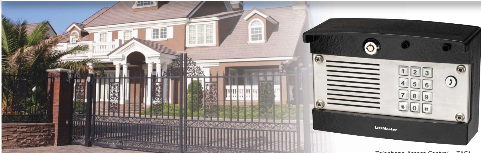
Telephone Access Control - TAC1